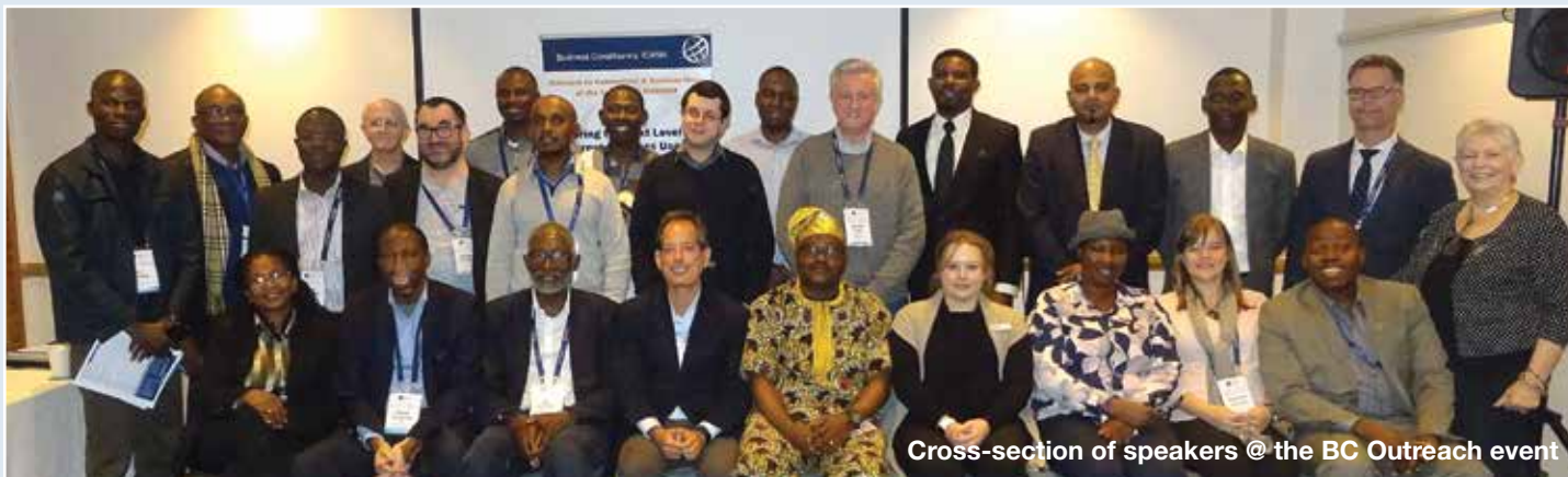
Cross-section of speakers @ the BC Outreach event

A half day outreach session was held to reach out to business executives in Johannesburg during ICANN59, at The Hilton, Sandton, on June 25, 2017.